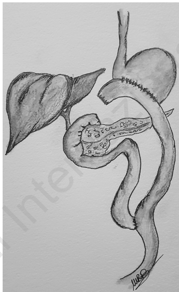
Figure 1 - Anatomy after a Roux-en-Y distal gastrectomy. PD is a challenging surgery in these patients.

The reconstructive phase for both patients consisted of a PJ and a hepaticojejunal anastomosis (Figure 2). Gastro-jejunal anastomosis was preserved. An end-to-side PJ was performed on the afferent limb of gastro-jejunal anastomosis: a Wirsung stented duct-to-mucosa anastomosis with a 4-0 monolayer absorbable suture and a sero-muscular jejunal – pancreatic stump anastomosis with a 3-0 monolayer non-absorbable suture. Wirsung stent was taken out through gastric wall. A termino-lateral hepaticojejunal anastomosis was performed with a 4-0 monolayer absorbable suture on an independent transmesocolic Roux-en-Y limb which was anastomosed with the efferent loop of the gastrojejunal anastomosis.